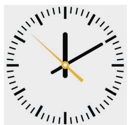
The focus is on the optimization of process times