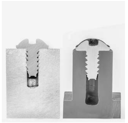
High flank coverage can be achieved for screw connections in light metal casting alloys and plastics